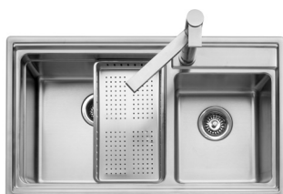
Stainless steel colander

Each sink includes a steel colander and a wooden chopping board designed to fit the bowl perfectly.