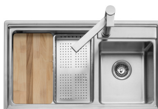
Stainless steel colander and beech chopping board